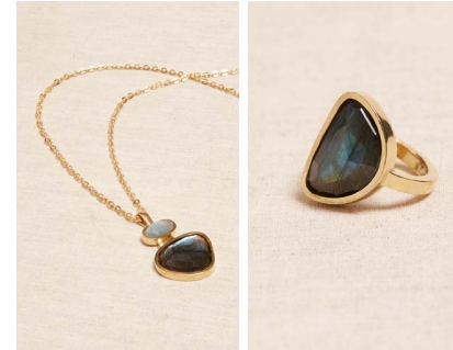
IRSA GEMSTONE PENDANT

We are endlessly captivated by the enduring beauty of natural semi-precious stones. Labradorite, a magical blue-gray stone, displays a swirling iridescence—sometimes, a whole spectrum of color might be observed in a single stone. Pyrite, also known as Fool's Gold, is a dark golden stone with extraordinary sparkle.