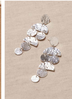
TOTEM SILVER EARRINGS These totem-inspired earrings are hand-cut and formed from brass sheet and finished with polished, high-shine silver-plating for extra eye-catching appeal. Silver-plate on brass. Posts are sterling silver.