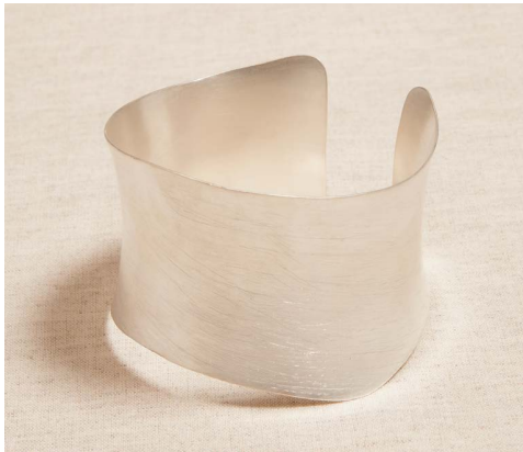
STATEMENT SILVER CUFF Satin silver-plated brass is hand-crafted into a wave-shaped cuff with a subtle brushed appearance. Silver-plate on brass.