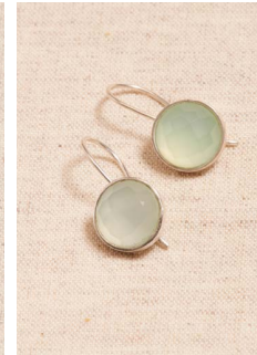
STONE DROP EARRINGS AQUA CHALCEDONY & MOONSTONE Aqua chalcedony is a lovely aqua blue member of the quartz family. Moonstone is characterized by a mysterious shimmer that mimics the luminescence of its namesake. The precisely faceted semi-precious stones are set into silver-plated brass bezels with attached earwires. Silver-plate on brass.