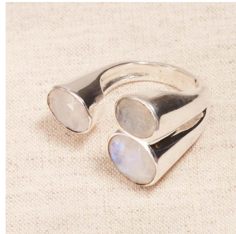
THERESE TRIPLE STONE MOONSTONE RING Three magically iridescent faceted moonstones are set asymmetrically into silver-plated brass in this show-stopping statement ring. Silver-plate on brass.