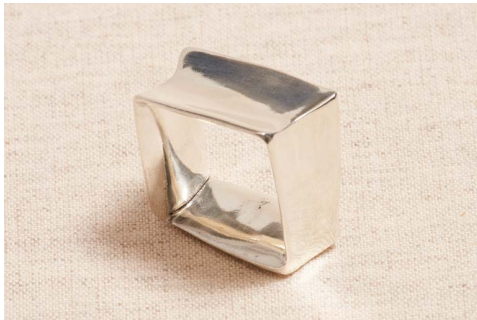
SILVER SQUARE RING The bold silver-plated square ring features an irregular, slightly concave shape and is polished to perfection for both shine and exceptional comfort on the hand. Silver-plate on brass.